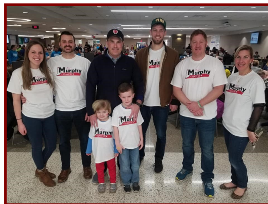
Kiwanis Pancake Breakfast 2019